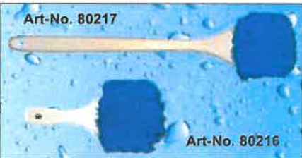
Brush Blu BETONAC Art-No. 80216 20 cm Art-No. 80217 50 cm