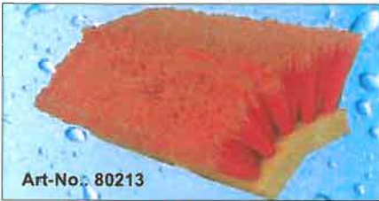
Brush BI-LEVEL ORANGE Art-No. 80213 22, 5 cm