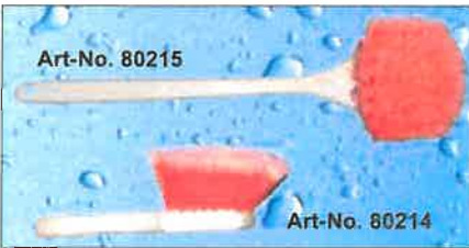
Brush ORANGE BETONAC Art-No. 80214 25 cm Art-No. 80215 50 cm